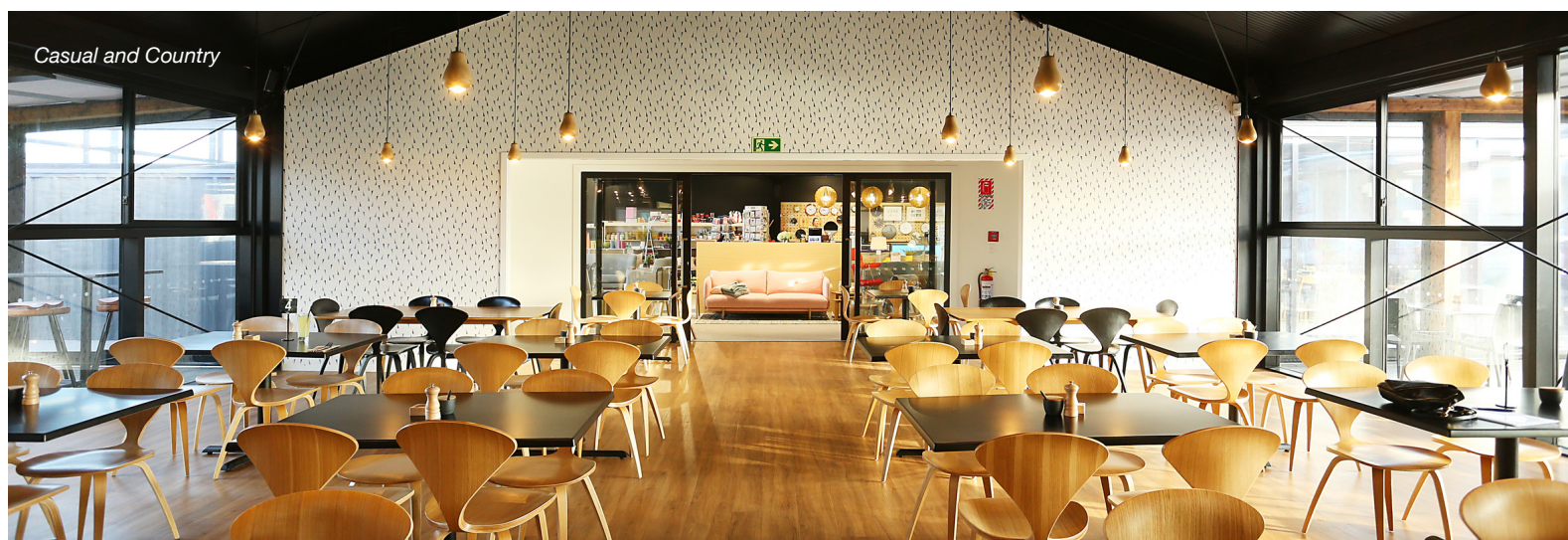
Casual and Country