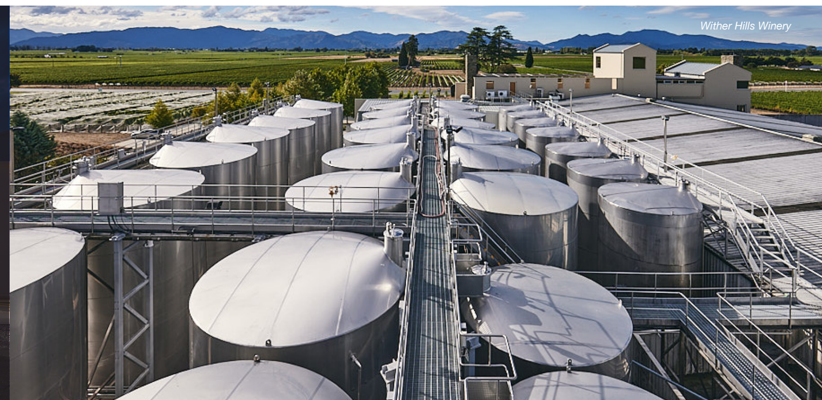
Wither Hills Winery